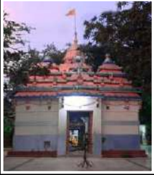
Saint Arakshita Das's Mausoleum